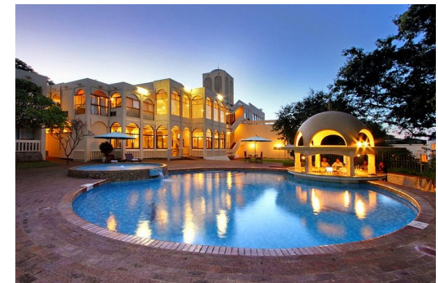
Victoria Falls, Rainbow Hotel, Zimbabwe